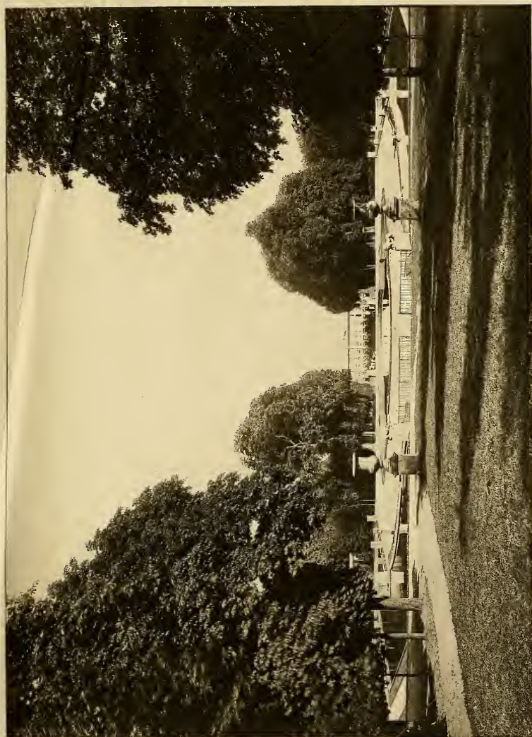
St. Vincent School